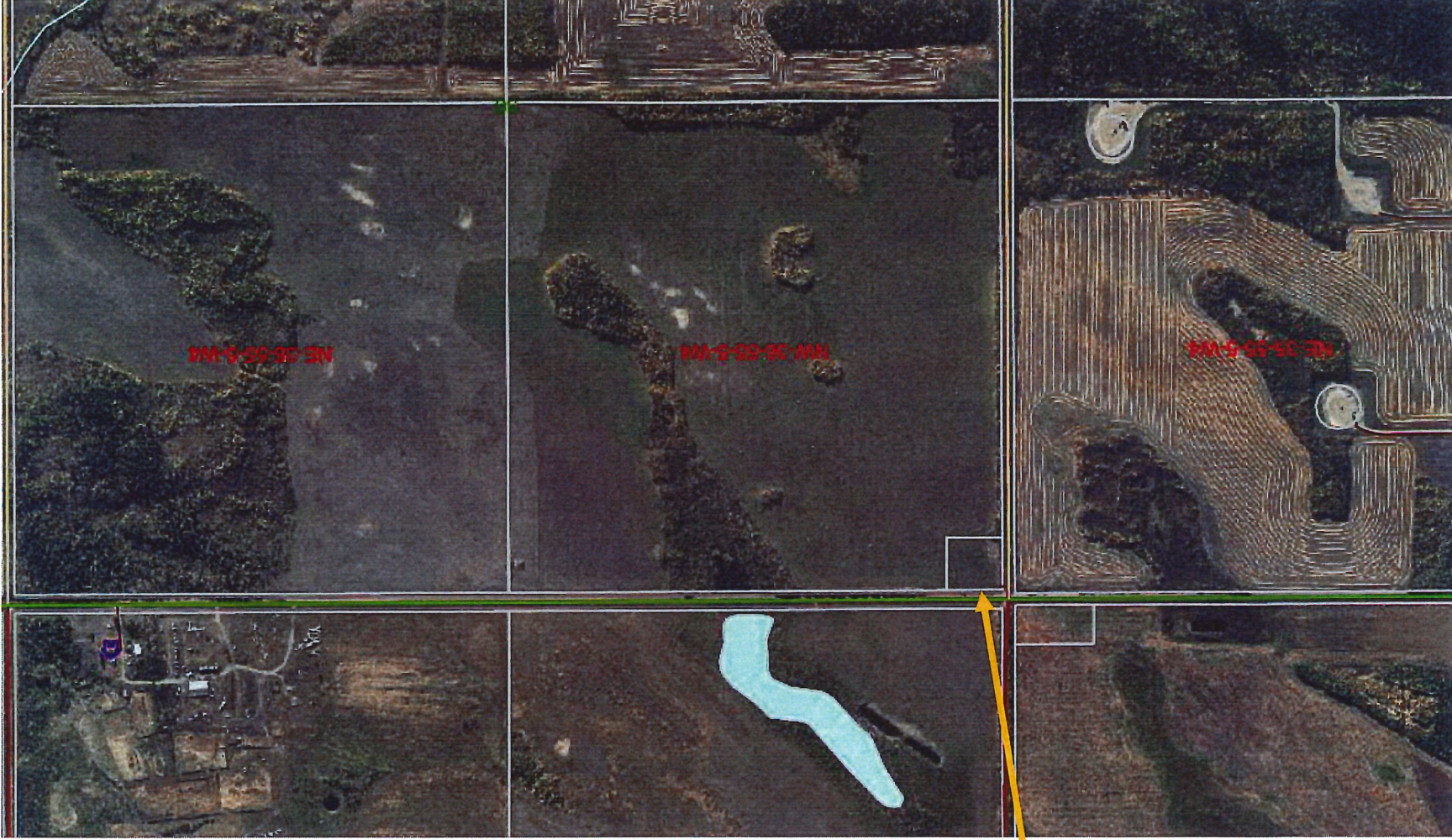
UKRANIAN GREEK ORTHODOX CHURCH (PRIMULA CEMETERY) PNW 36-55-5-4- 1.88 ACRES - ROLL 5636501