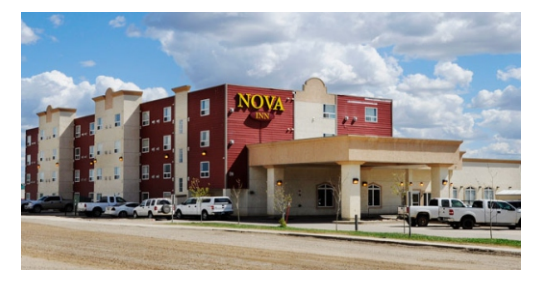
Nova Inn Peace River