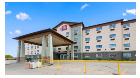
Best Western Plus