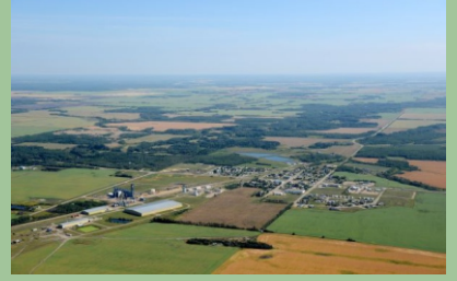
Village of Nampa, AB