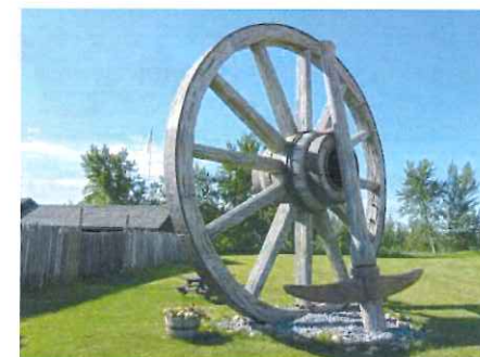
World's Largest Pick Axe and Wagon Wheel

This Conference is Alberta Environment approved for 'Continuing Education Units'