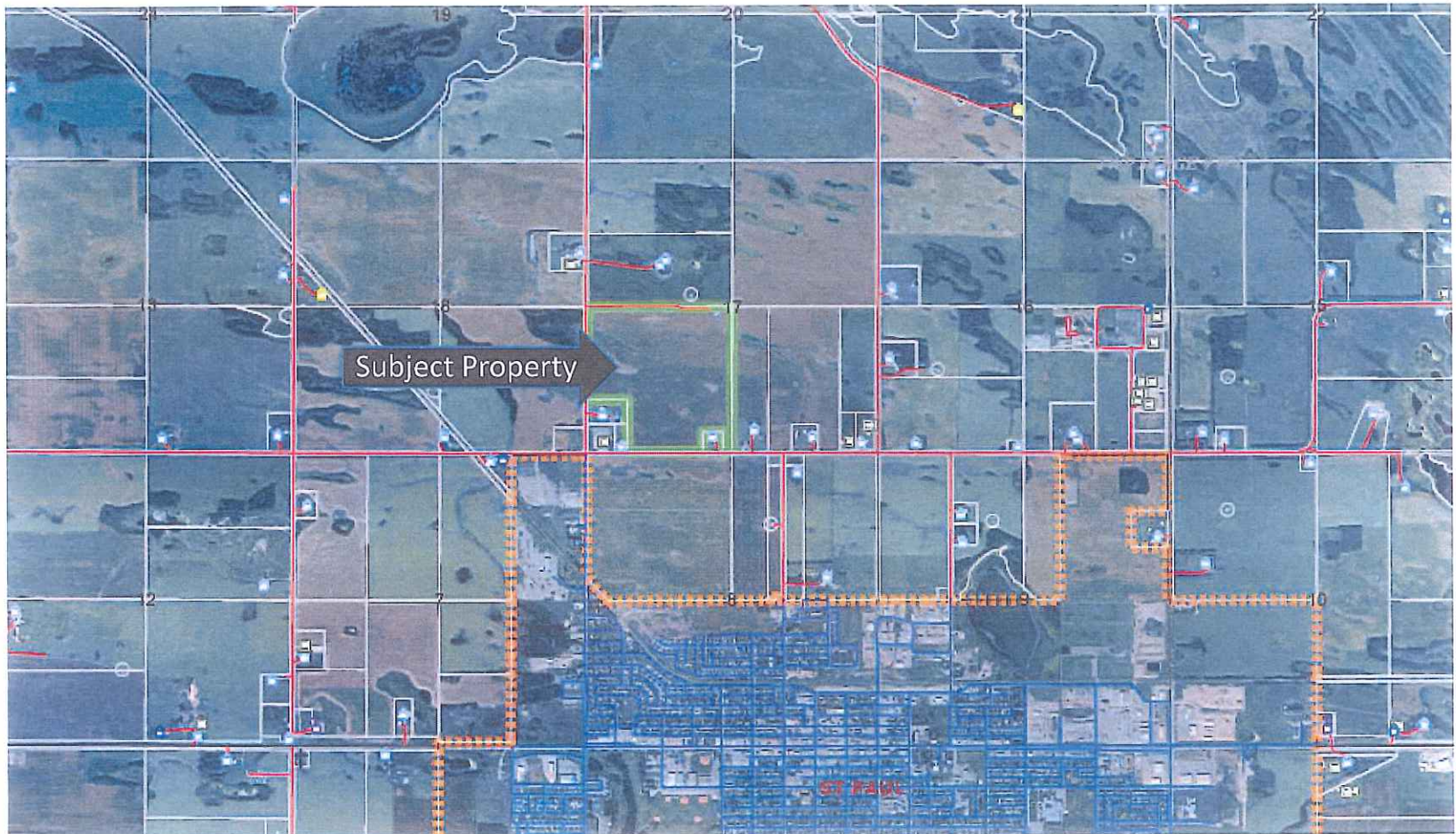
Figure 1.0 – General Location Map