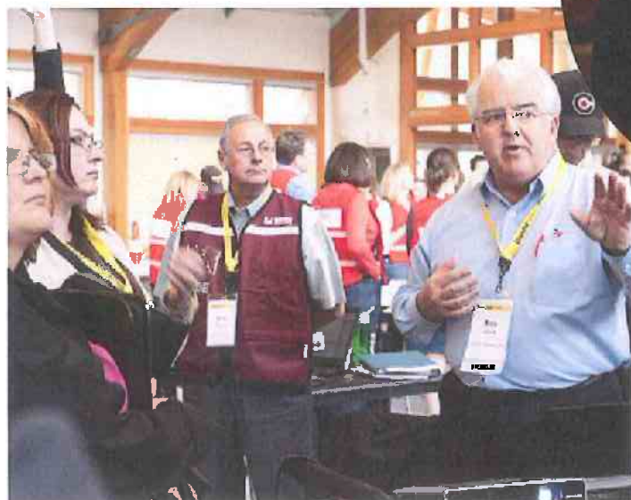
Off-site simulation, Disaster Forum 2012